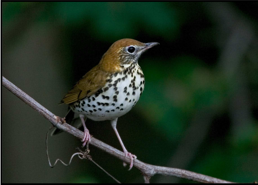
Wood Thrush by Gordie Ellmers

glued to our eyes, we identified a variety of sparrows and finches, as well as swallows, a Killdeer, a male Yellow Warbler, and a brilliant orange and black male Baltimore Oriole.