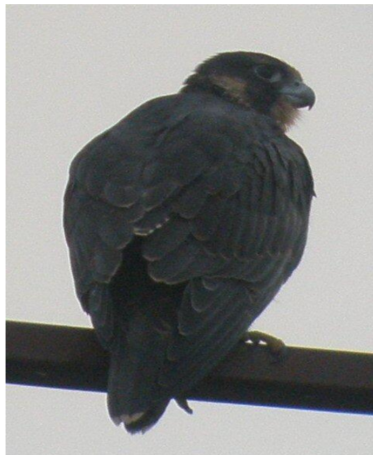
Glens Falls Peregrine Falcon fledgling Photo taken through telescope July 2, 2012