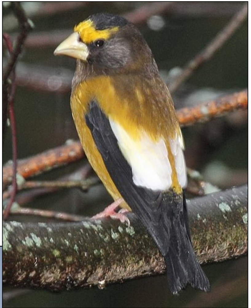
Above: Male Evening Grosbeak

The adult Evening Grosbeak male is unmistakable and breathtaking, with a bold pattern of yellow, white and black. It has the same general colors as the delicate American Goldfinch, but is much chunkier, larger, noisier, and has a huge chalky bill. The females are duller gray overall.