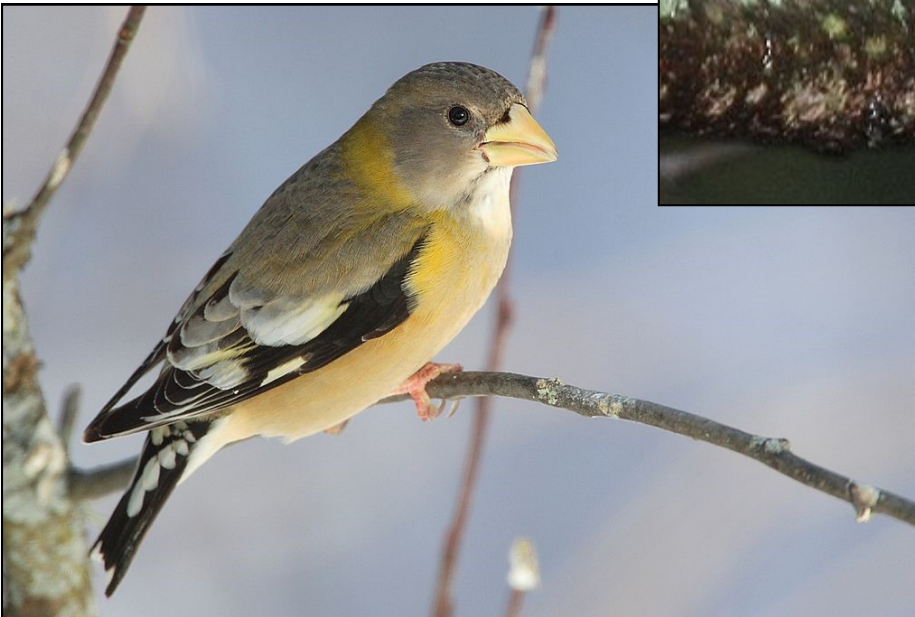
Left: Female evening grosbeak in Algonquin Provincial Park, Ontario, Canada, 2007.

A flock of these scrappy grosbeaks can leave one breathless with their flurry of activity and abrupt shrieking chirps. You can watch videos of them in action at the Ontario FeederWatch webcam: https://www.allaboutbirds.org/cams/ontario-feederwatch/ . Evening Grosbeaks eat spruce budworms and tree seeds, and will devour sunflower seeds at feeders.